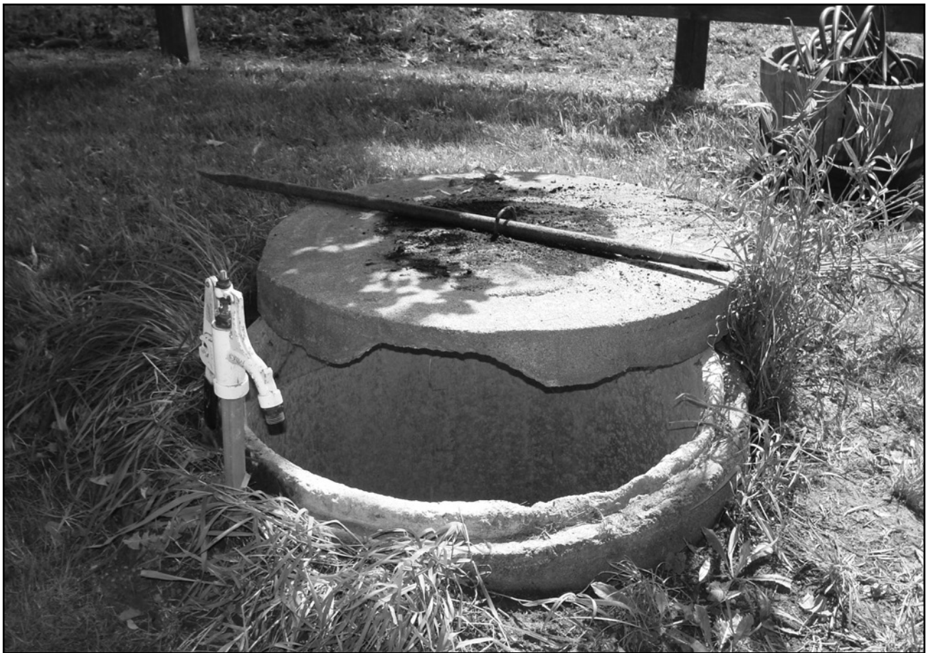
Figure 1: Damaged Lid and Casing

PHIs also monitor sampling compliance and results of tests on a regular basis. When adverse water quality incidents (AWQIs) are reported, PHIs follow-up with the owner/operator, provide directions as necessary, and ensure corrective actions are taken. In addition, the Health Unit discloses the results of the risk assessments, the risk level, and any adverse events for SDWS.