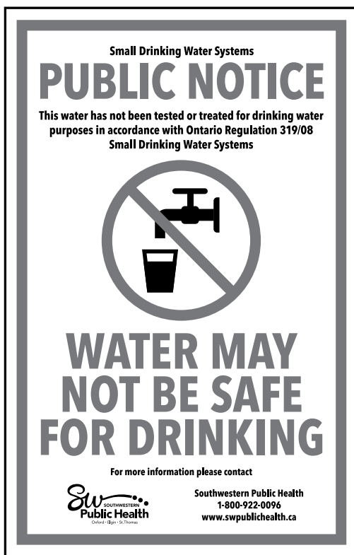
Figure 5: Example of Signage for a Posted System

The directive issued by a PHI may require an owner/operator to post and maintain warning signs notifying users not to consume water from the SDWS. Routine checks of signage at all entrances and access points to water are required. This is to confirm signs are posted, in a good state of repair and are easily readable. Even if a system is posted, operators should still be checking the well and other components of the system to prevent contamination of the source water. The frequency of routine checks is determined by your PHI who takes into consideration the type of facility and usage.