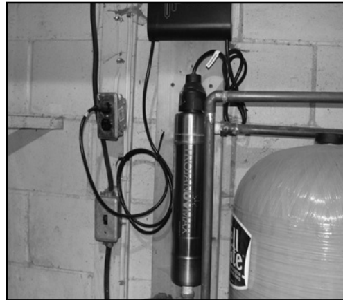
Figure 2: Ultraviolet Light System

Ultraviolet treatment systems use ultraviolet light to inactivate or kill bacteria, viruses and cysts in contaminated water. The UV system is also required to have an alarm or an automatic shut-off. The purpose of the alarm is to notify the operator there is an issue with the treatment device and an automatic shutoff will stop directing water to the users if the UV system fails to treat the water.