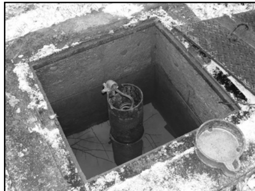
Figure 4: Potential Surface Water Contamination