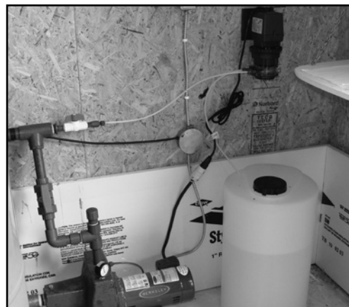
Figure 3: Chlorine Injector

Secondary treatment provides water treatment in the distribution system. It involves maintaining minimum disinfection residuals that protect the water from microbiological re-contamination, reduce bacterial re-growth, control biofilm formation, and serve as an indicator of distribution system integrity. Examples of secondary treatment include chlorine, chlorine dioxide and monochloramine. A seasonal campground is an example of a SDWS that requires secondary treatment due to the many connections associated with the system.